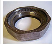
Axel Bearing, Adjusting Nut