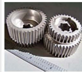
Hammer Drill Output Gears